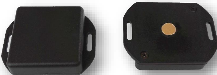
Electra Contact temperature sensor tag